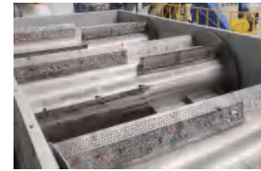
分离沉淀池 Sink-float Tank 充分浸润和分散物料，还可通过密度分选，得到沉水料和浮水料。 Wets and scrambles materials. Also, works as density separation to get buoyant and non-buoyant.