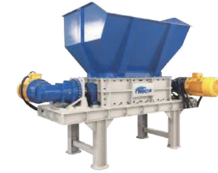
撕碎机 Shredder 可选破袋机、预碎机和撕碎机，让物料细化到40mm左右。 Pre-shredder, bag-breaker makes sure stream materials to 40mm.